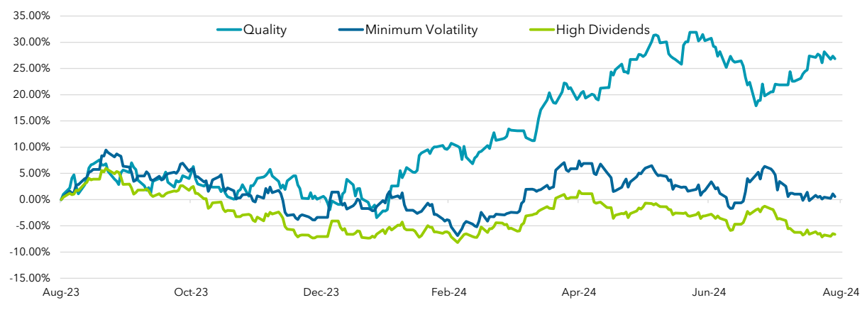
FIGURE 5. MSCI JAPAN FACTOR INDEXES SPREAD AGAINST MSCI JAPAN*

*The measurement begins from the end of August 2023, starting from 0%.