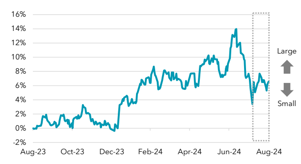
FIGURE 4. LARGE-SMALL CAP SPREAD

Note: The spread between the Russell/Nomura Large Cap Index and the Small Cap Index (Positive figure means Large Cap dominant)