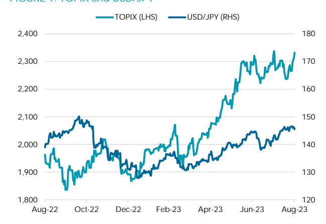
FIGURE 1. TOPIX and USD/JPY