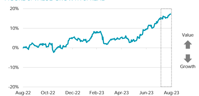
FIGURE 3. VALUE-GROWTH SPREAD

Note: The spread between the Russell/Nomura Value Index and the Growth Index (Positive figure means value dominant)