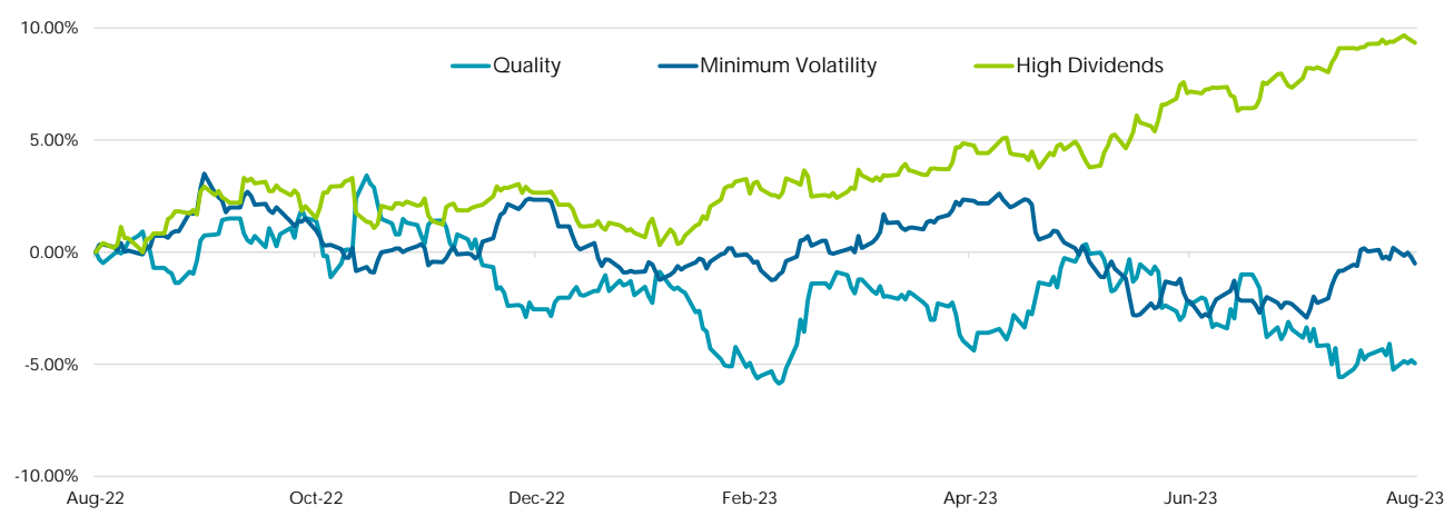
FIGURE 5. MSCI JAPAN FACTOR INDEXES SPREAD AGAINST MSCI JAPAN*

Note: The spread between the Russell/Nomura Large Cap Index and the Small Cap Index (Positive figure means Large Cap dominant)