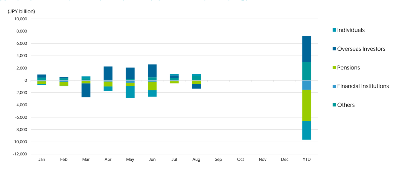
FIGURE 6. MONTHLY INVESTMENT ACTIVITIES BY INVESTOR TYPE IN THE JAPANESE EQUITY MARKET**